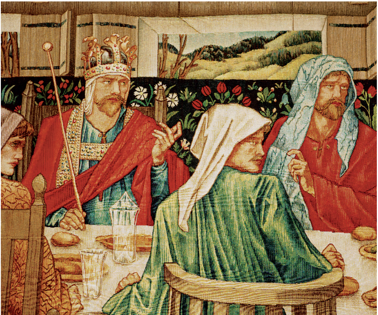
Detail of The Holy Grail Appears to the Knights of the Round Table (1927–1932), by Morris & Company, Merton Abbey Tapestry Works, after design about 1891 by Edward Burne-Jones. 250 cm × 530 cm. Münchner Stadtmuseum, Munich.

25 breastplate or gorget (gôr'jīt) or iron cleats : armor for the chest, the throat, or the shoulders and elbows.