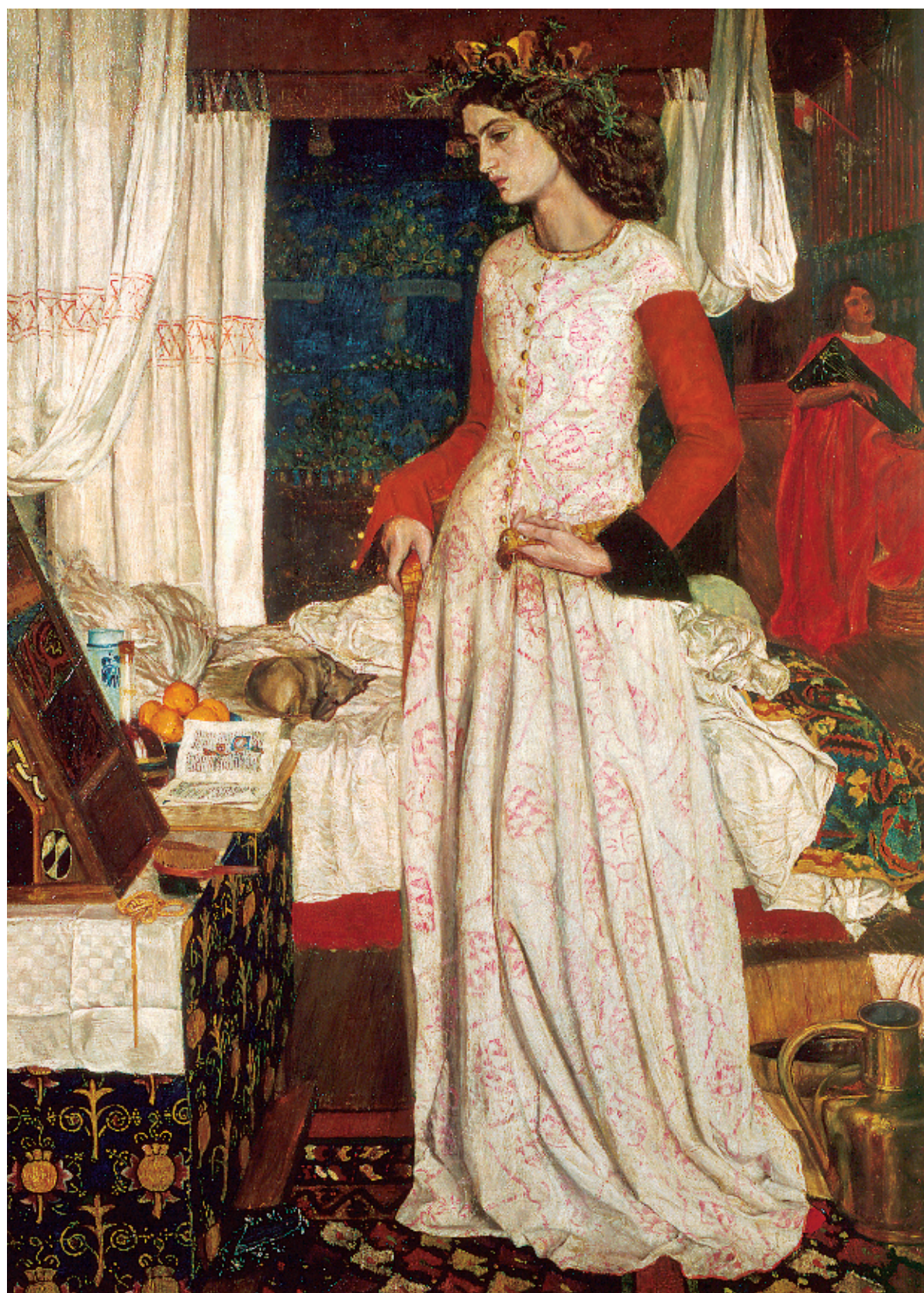
Queen Guinevere (1858), William Morris. Oil on canvas.