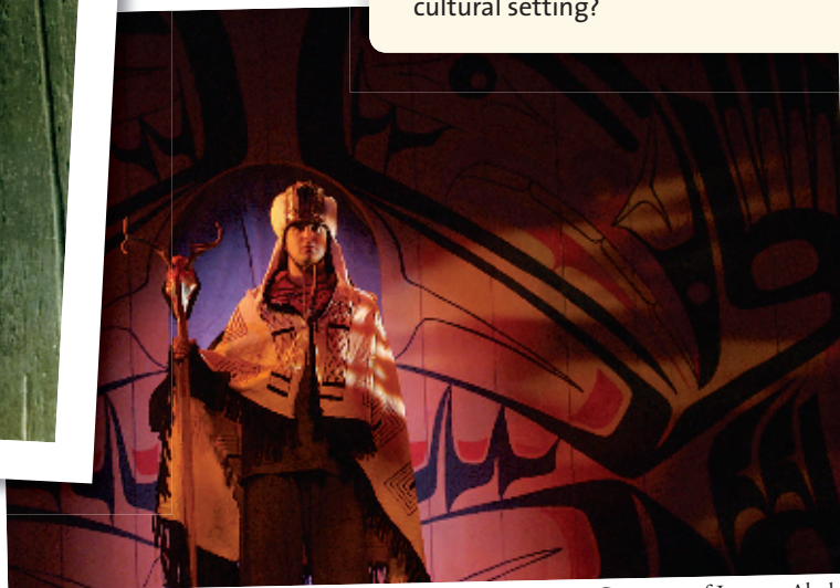
Macbeth , performed in 2004 by the Perseverance Theatre Company of Juneau, Alaska

With its universal themes of ambition and guilt, Macbeth is often reimaged in other cultural settings. These photos show a Zulu version of the play, set in South Africa; a famous film adaptation, Throne of Blood , set in medieval Japan; and a version set among the Tlingit, an Alaskan native tribe. Notice how the settings and costumes, such as the Japanese statue and samurai dress in the middle photo, reflect these different cultural contexts.