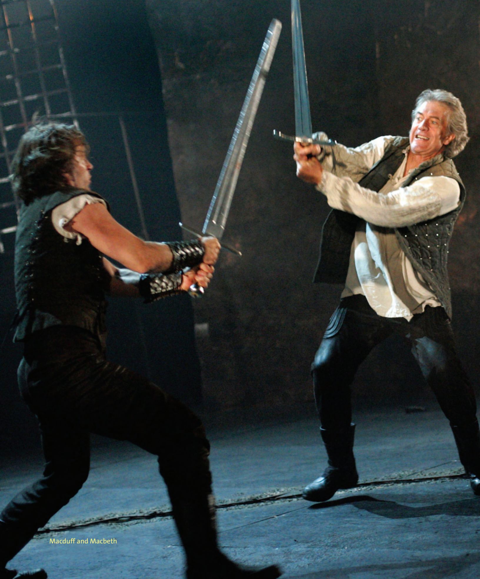
Macduff and Macbeth