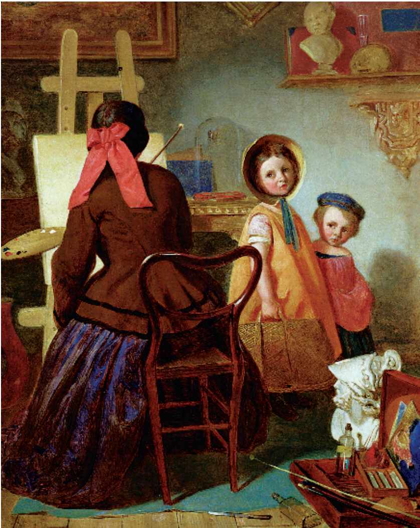
In the Artist's Studio (1800s), Thomas Myles. Oil on canvas, 39.4 cm × 29.2 cm. Private collection.

130 made clean, and not trivial ceremonies observed, which it is not very difficult to fulfil with scrupulous exactness when vice reigns in the heart.