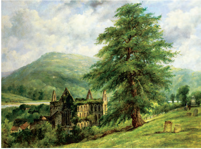
Tintern Abbey (1800s), Frederick Waters Watts. Private collection.

And mountains; and of all that we behold 105 From this green earth; of all the mighty world Of eye, and ear—both what they half create, And what perceive; well pleased to recognize In nature and the language of the sense The anchor of my purest thoughts, the nurse, 110 The guide, the guardian of my heart, and soul Of all my moral being.