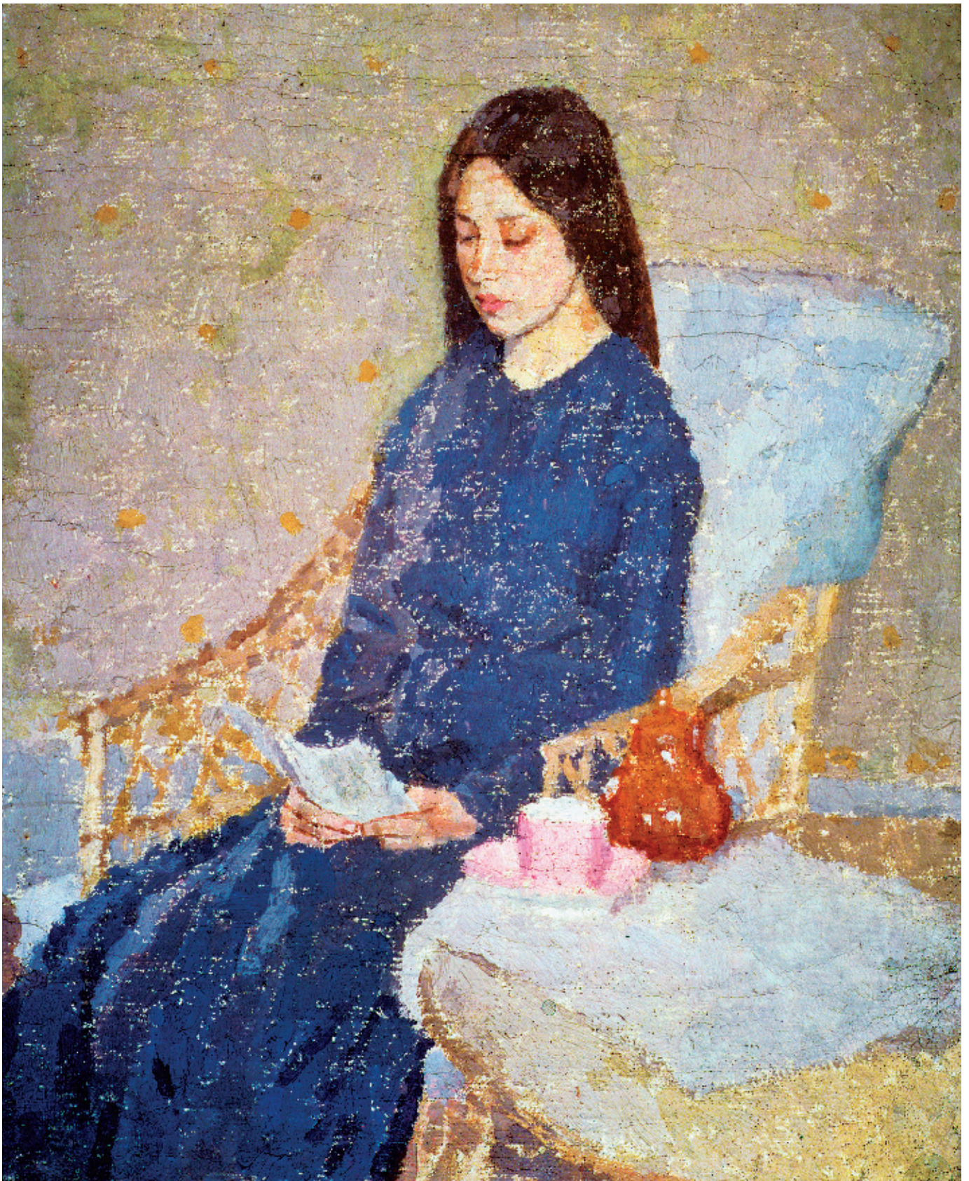
The Convalescent , Gwen John. Oil on canvas, 40.9 cm × 33 cm. PD.24-1951.