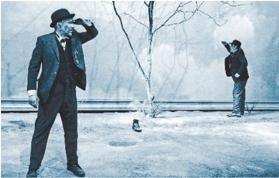
A scene from Waiting for Godot

nothing-very-much-thank-you. About as pointless and inglorious as stepping in front of a bus.”