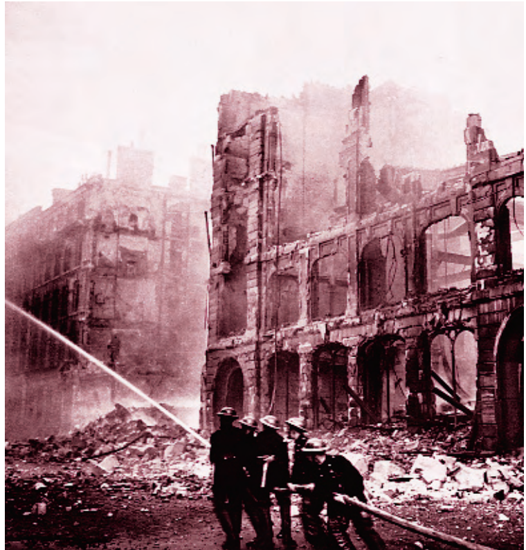
British firefighters battle the results of a German air attack during the Battle of Britain.

After the war, Britain was financially drained, burdened by debt and the need to rebuild its cities. Everything, from butter to socks, was rationed. Determined to provide at least the basic necessities, the new Labor government transformed Britain with a new national health care system and public education. Liberal in outlook and concerned with pressing domestic issues, Labor leaders had little desire to cling to far-flung colonies eager for self-rule. Instead, they gave India its independence in 1947, continuing a trend begun in the 1920s of dissolving the British Empire into a loose commonwealth of independent nations.