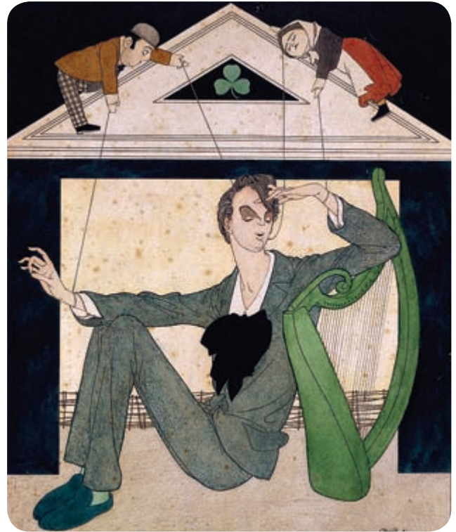
W. B. Yeats and the Irish Theatre (1915), Edmund Dulac. Paint, watercolor, ink.

Yeats and his colleagues faced a dilemma. The true Irish language—the language of its history and folklore—was Gaelic. However, few people in Ireland actually spoke Gaelic anymore. If the writers wanted to be understood, they had to write in English; but English carried with it centuries of culture based in England, not Ireland. (Yeats himself was very much an heir to the English romantics.) In order to create an authentically Irish literature written in English, Irish writers turned to the legendary accounts of the Irish heroes Cuchulain and Finn MacCool for inspiration and to the colorful speech of the Irish peasants, who, to the writers, represented