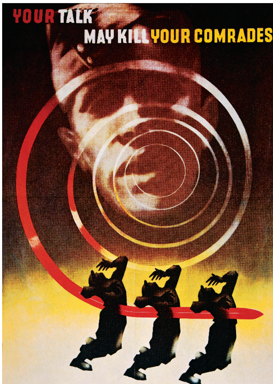
Your Talk May Kill Your Comrades (1942), Abram Games. World War II Poster. The Granger Collection, New York.