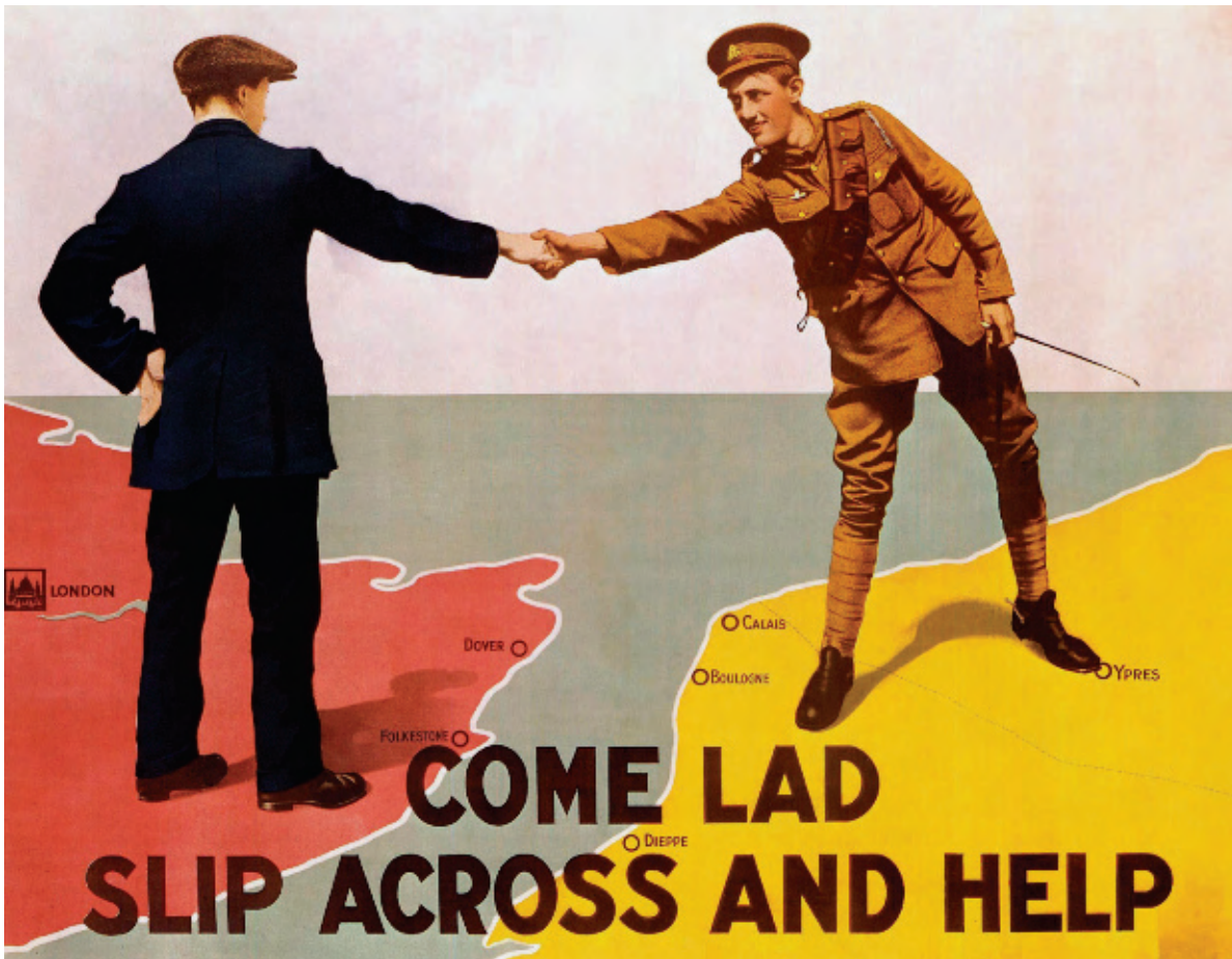
Come Lad, Slip Across and Help , World War I Poster.

“force” which they use in a baton charge. 17 And finally there is the “force” used in war. This, of course, varies with the technological devices at the disposal of the belligerents, with the policies they are pursuing, and with the particular circumstances of the war in question. But in general it may be said that, in war, “force” connotes violence and fraud used to the limit of the combatants’ capacity.